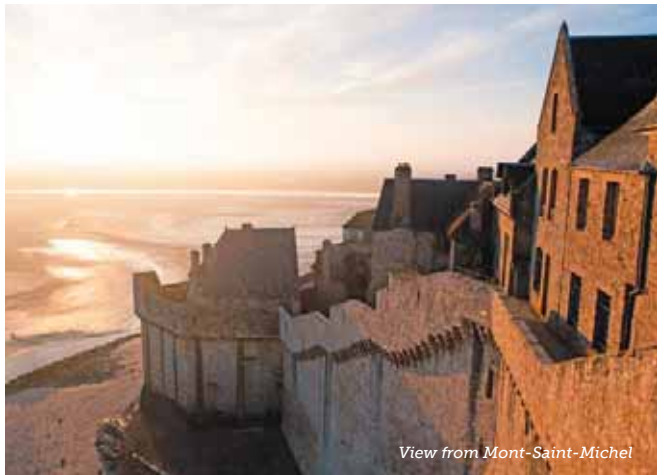
View from Mont-Saint-Michel