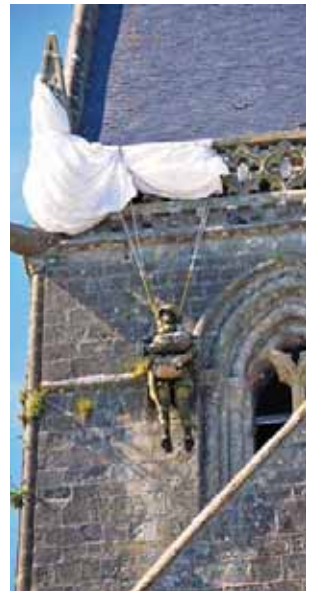
Private John Steele Monument, Sainte-Mère-Église

Knowledgeable Lecturers deepen your appreciation for the region and its history, culture and current events.