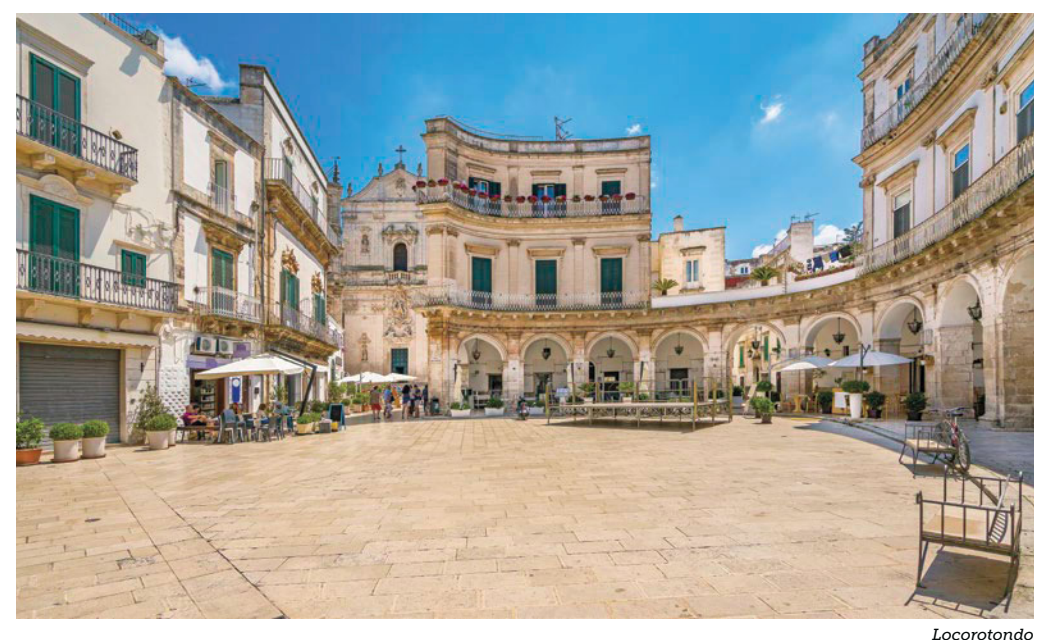
Day 1 | In Transit

Depart your gateway city for Bari, Italy.