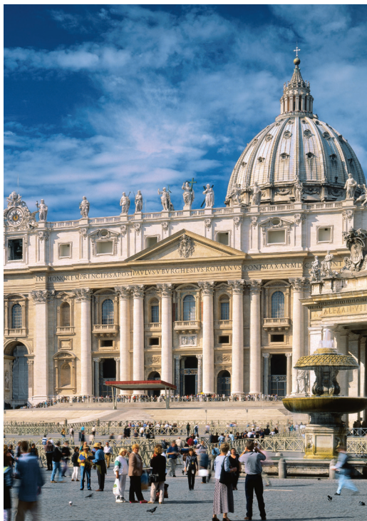
We visit St. Peter’s Square and Basilica on Day 6.