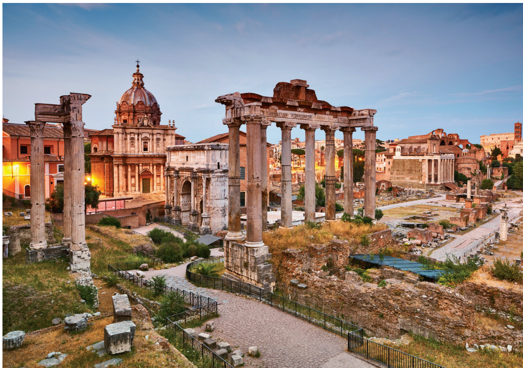
The Roman Forum dates to the 7 th century BCE.

shopping along the fashionable Via Veneto; sipping espresso in beautiful Piazza Navona; seeing the Pantheon, the city's best preserved ancient building; tossing a coin into Trevi Fountain; or visiting any number of renowned museums and churches. B