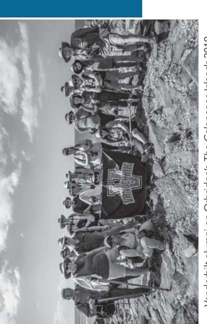
Vanderbilt alumni on Orbridge's The Galapagos Islands 2019 travel program.