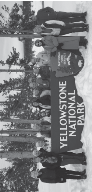
Vanderbilt alumni on Orbridge's Wolves & Wildlife of the Yellowstone 2019 travel program.