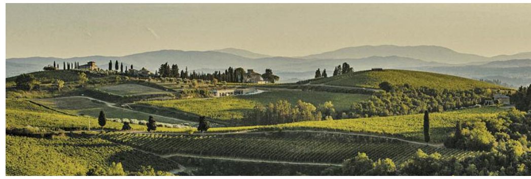
Top: Ponte Vecchio over the Arno | Above: Hills of Tuscany

Discovery: Accademia Gallery. Explore one of the city's most celebrated museums, which houses Michelangelo's larger-than-life,