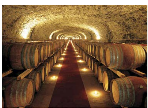
Castello di Monsanto wine cellar

Discovery: Siena. Feel the warmth of storied Siena, the Middle Age gem known for its rosy-pink hue. A guided tour takes you to see the acclaimed, shell-shaped Piazza del Campo; the Torre del Mangia, Siena's iconic bell tower; and Fonte Gaia, the Joyful