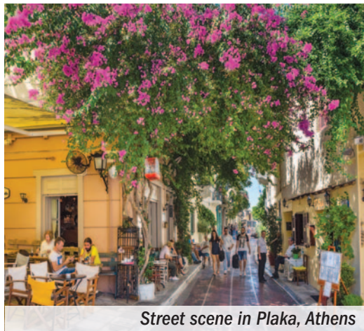
Street scene in Plaka, Athens