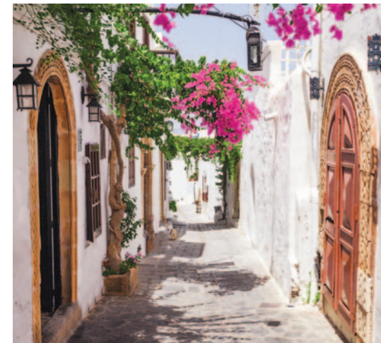
Narrow street, Lindos, Rhodes

Our morning tour of the island will include its most important sites, including the Temple of