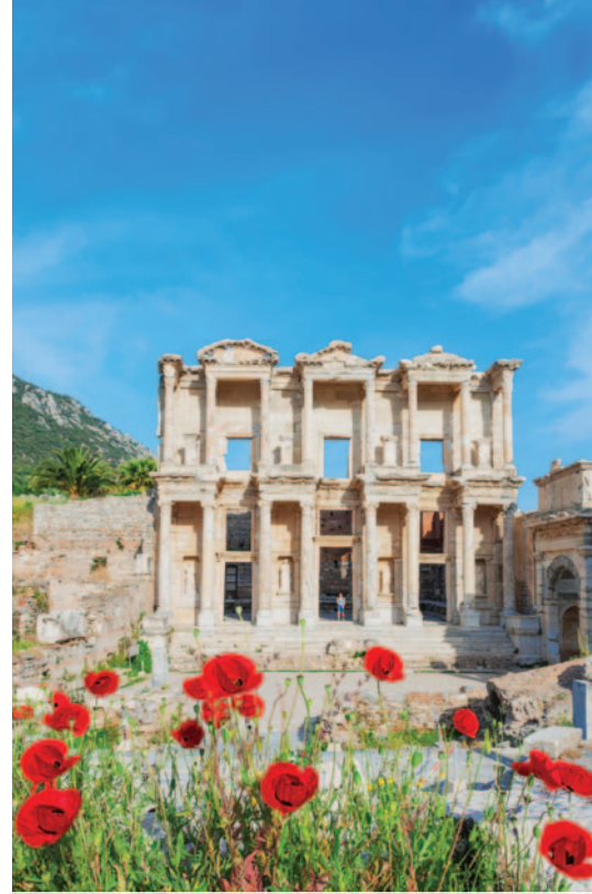
Library of Celsus, Ephesus