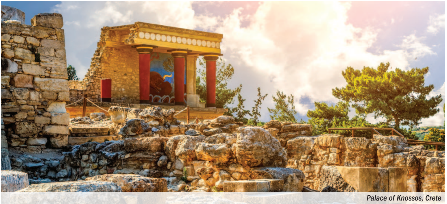
Palace of Knossos, Crete