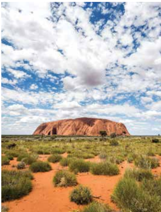
We visit the Aboriginal site of Uluru (Ayers Rock) on Day 8.

En route to Auckland, we stop at Ruakuri Caves to see