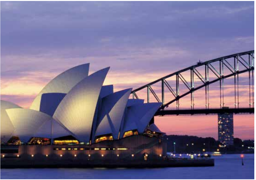
The Sydney Opera House and Harbour Bridge at dusk

Day 9: Ayers Rock/Sydney This morning we visit the base of Uluru and the interesting museum here. Mid-day we fly to Sydney, arriving late afternoon. B,D