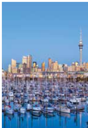
Auckland, City of Sails

Day 18: Queenstown/Rotorua We depart today for the Maori center of Rotorua, with its geysers, bubbling mud pools, and hot thermal springs. Upon arrival, we take a panoramic tour of this city on the shores of Lake Rotorua. This evening we visit Te Puia Thermal Reserve and Cultural Centre for a traditional hangi dinner and Maori performance. B,D