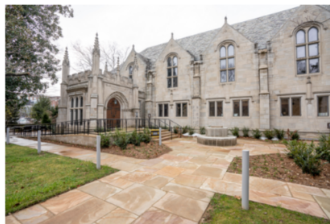
(1101 19th Ave. Home to the Faculty Senate Office, Faculty Commons and Digital Commons)

The Faculty Senate is the representative and deliberative body of the Faculties. Centrally involved in the governance of the university, it comprises elected members, deans of the colleges and schools, and ex officio members, including the Chancellor. Click here to learn more about shared governance at Vanderbilt.