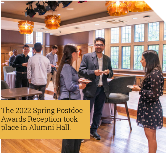
The 2022 Spring Postdoc Awards Reception took place in Alumni Hall.