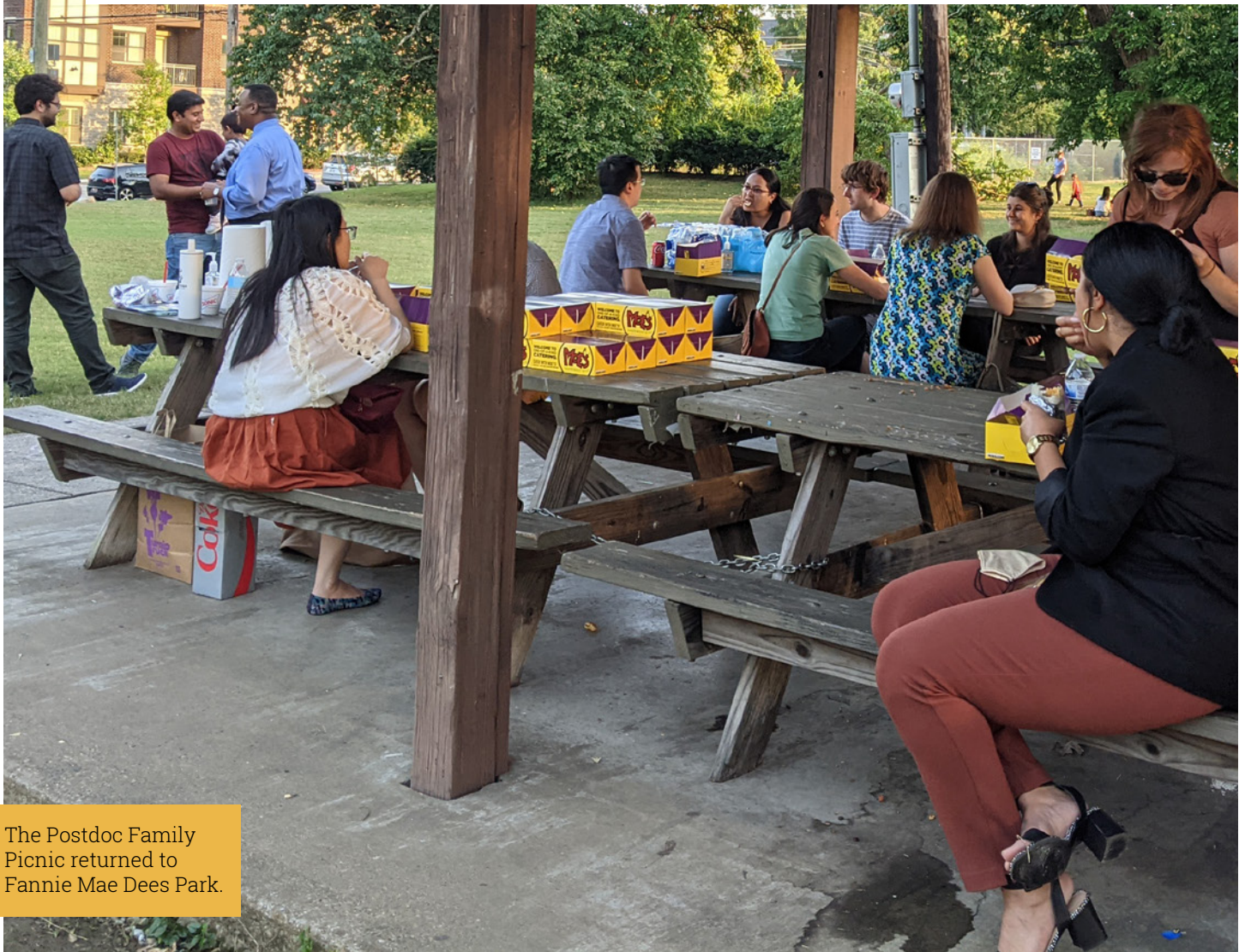
The Postdoc Family Picnic returned to Fannie Mae Dees Park.