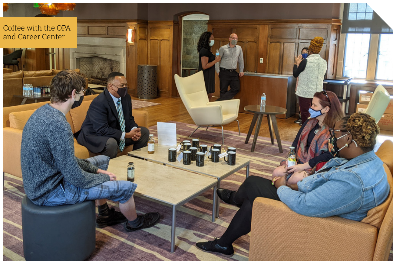
Coffee with the OPA and Career Center.

National Postdoc Appreciation Week recognizes the significant contributions that postdoctoral fellows make to U.S. research and discovery. The 12th Annual National Postdoc Appreciation Week was held September 20–24, 2021.