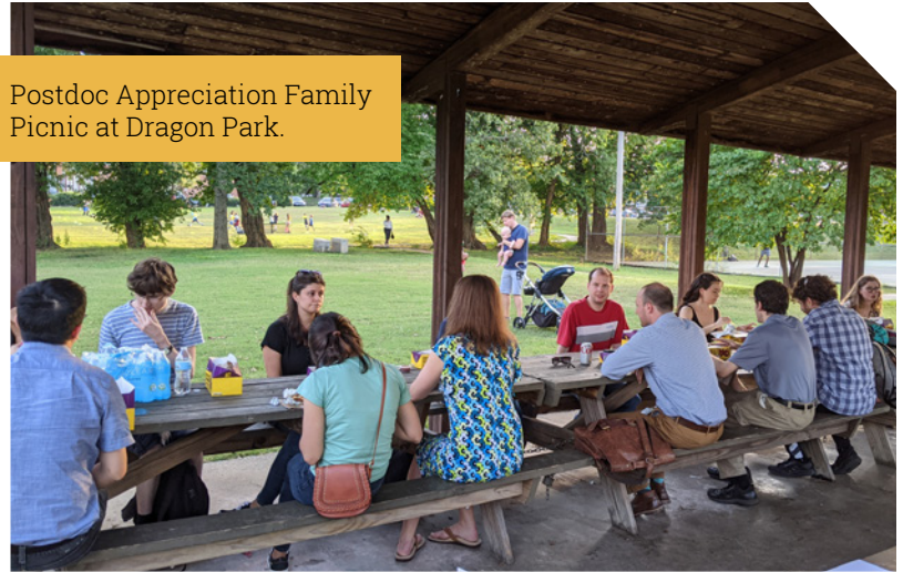
Postdoc Appreciation Family Picnic at Dragon Park.