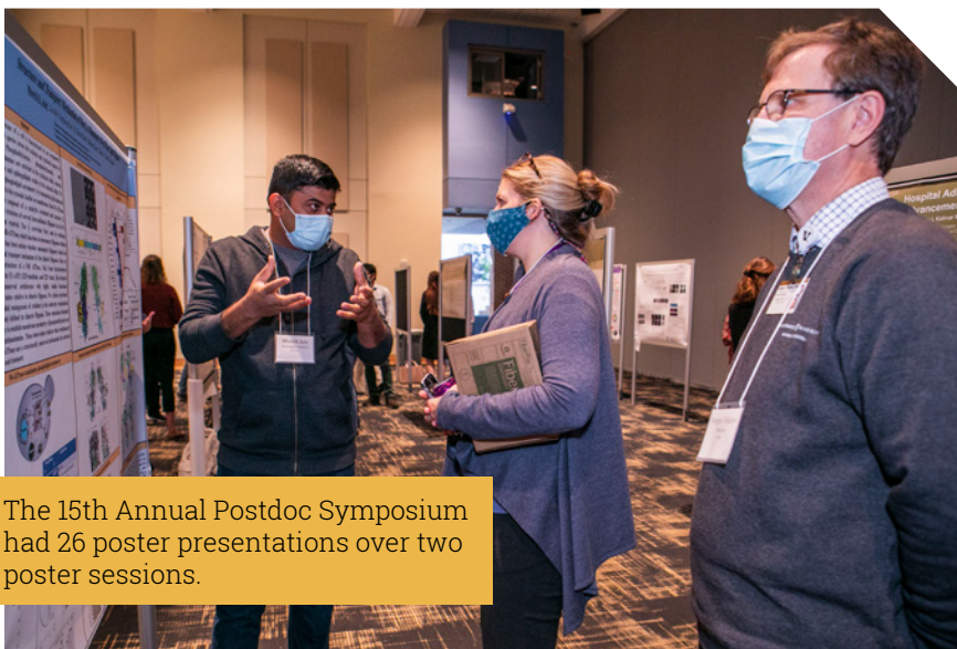
The 15th Annual Postdoc Symposium had 26 poster presentations over two poster sessions.