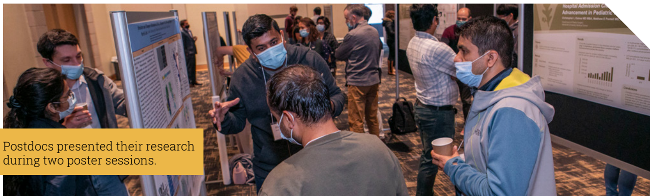
Postdocs presented their research during two poster sessions.