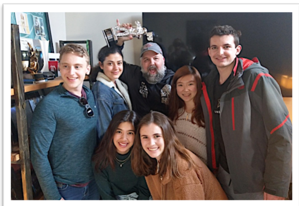
Revolution Films Field Trip

The show also provided the Curb Scholars with the opportunity to view 'Remand' , a film about the Ugandan criminal justice system by Revolution Films founder and executive producer Randy Brewer. The screening was followed by a Q&A, and an opportunity to tour Revolution and spend time learning about the local and national film industry with Randy.