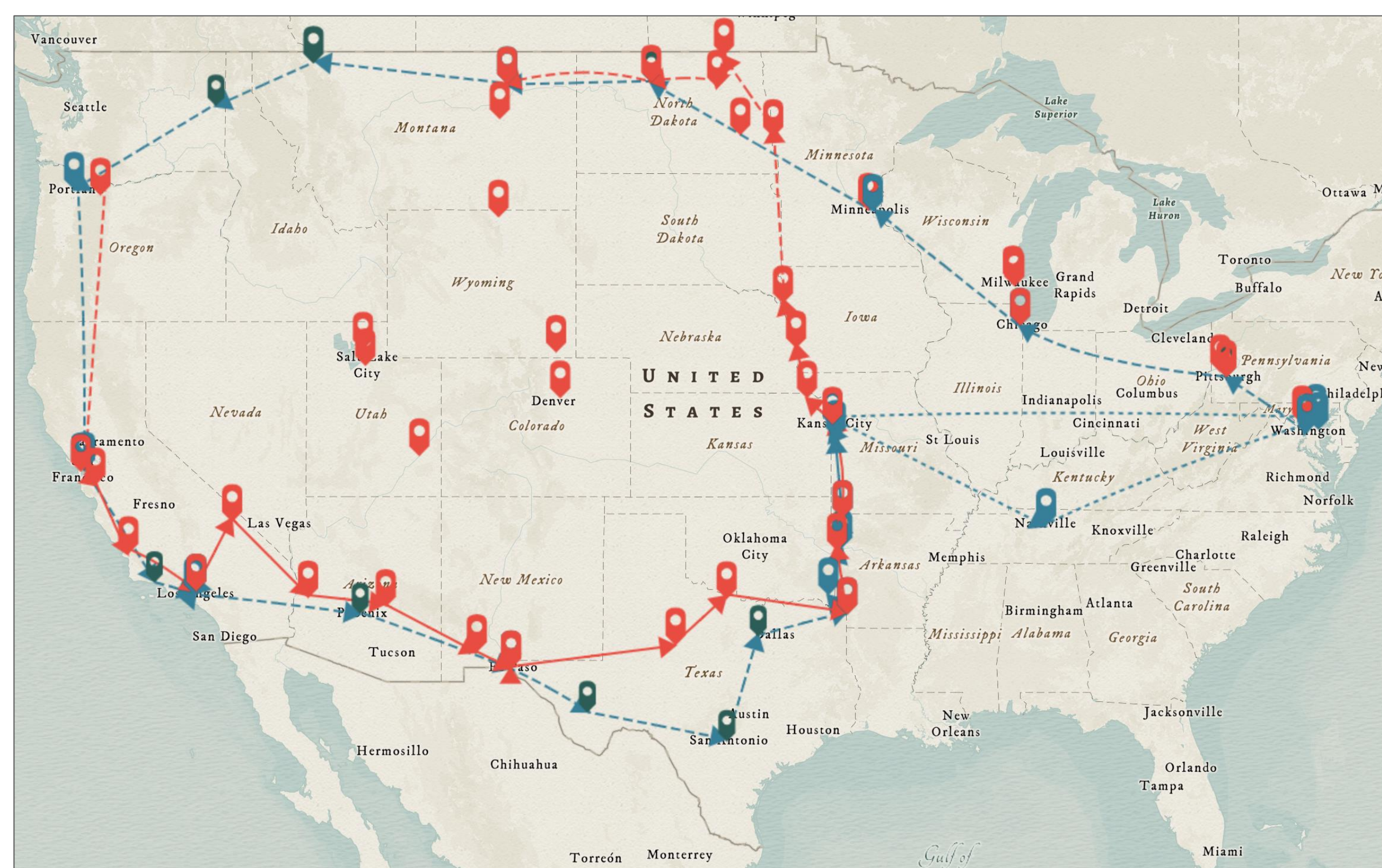
Interactive Story Map BLUE = 2018; RED = 1924-25

In 1924–25, three teenage farmers’ sons set off to see the United States, hopping freight trains from Maryland to San Francisco and back. In 2018, the 40-something granddaughter of one of the men recreated their journey, taking her mobility-impaired, homebody septuagenarian mother along for the 7,000-mile ride. Throw Momma on the Train tells the stories of both adventures, examining changes and continuities in women’s and men’s geographic mobility and the stories family members tell about travel and about one another. This online exhibit, a companion website for the creator’s book-in-progress, uses the digital multimedia platform ArcGIS StoryMaps. Interactive maps feature each stop on the two journeys, showcasing excerpts from the travelers’ diaries, “then” and “now” photographs, city histories, short sociological essays, videos, music, interviews, and links to external resources.