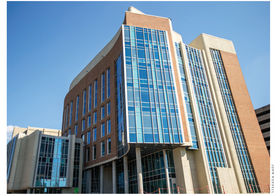
Vanderbilt's Innovation Pavilion houses the Wond'ry, the university's new cross-disciplinary hub of innovation and discovery. Above is the exterior of the Innovation Pavilion, and at left is its interior staircase.

ski, the Evans Family Executive Director of the Wond'ry at the Innovation Pavilion. “This center will bring together the incredible creativity and discovery that happens every day across the university. The name ‘Wond'ry’—a combination of ‘wonder’ and ‘foundry’—reflects our mission to channel Vanderbilt's intellectual energy from a range of disciplines and backgrounds into fostering true innovation.”