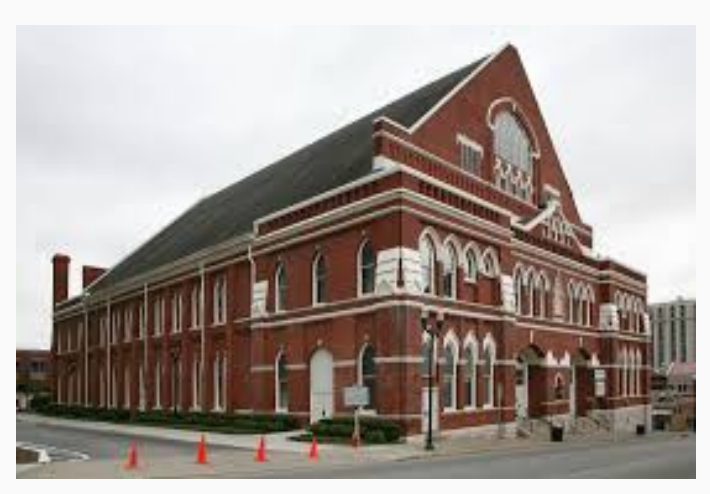
This is a list of some of the highlights of Nashville! Hopefully this list will make planning your visit easier.