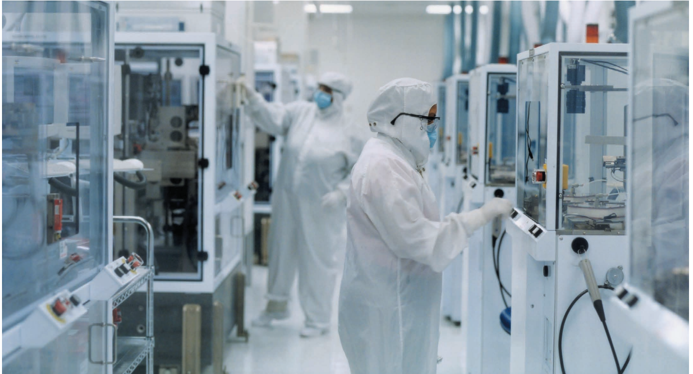
Scientists at the biotechnology company Affymetrix in Santa Clara, California. Positions in the biotechnology sector are highly sought after.